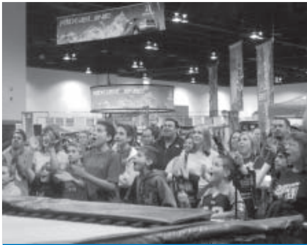
Denver expo-goers were awed by the high-flying trampoline action in the Honda Action Sports Zone.

the mountains, right at the expo. Special thanks to Big Mountain and Whistler for their sponsorships of the features in Seattle, as well as our media partners, King 5-TV, the Seattle Times, and the Entercom radio group.