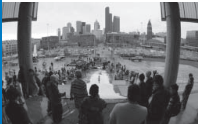
The Downtown Throwdown Rail Jam competition featured outstanding performances by skiers and riders on real snow, right in downtown Seattle